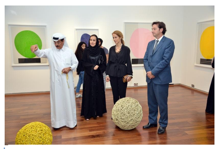
The Qatari Minister for Culture, HE Dr Hamad bin Abdulaziz Al Kuwari enjoying an exhibition tour with Her Majesty's Ambassador to Qatar Nicholas Hopton

I'm familiar with aspects of Islamic art as there are great examples at the British Museum, the Metropolitan and the V&A, so it wasn't new to me. However, seeing that range of quality in one place as the sole focus of the museum enabled me to dwell on it and look at it more closely. I enjoyed it all, from the Persian miniatures through to the ceramics and the calligraphy; some of it is so modern! The patterns and the abstraction are also amazing. I'm not so interested in the ornate and complicated designs, I preferred the simpler patterns. The best art is as fresh now as it was then, although maybe in different ways. I noticed that the colours are really intense and are probably the same colour now as they were 1200 years ago. It humbles you a bit and I have a deep, deep